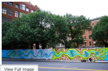
View Full Image