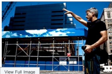
View Full Image

To select the artists, the Alliance works with four local art curators. It then identifies artists who would be willing and able to work within an established set of guidelines. Works of art that are intended for construction sites have to be easy to maintain and de-install. They also have to be somewhat modular, in case the site's dimensions change.