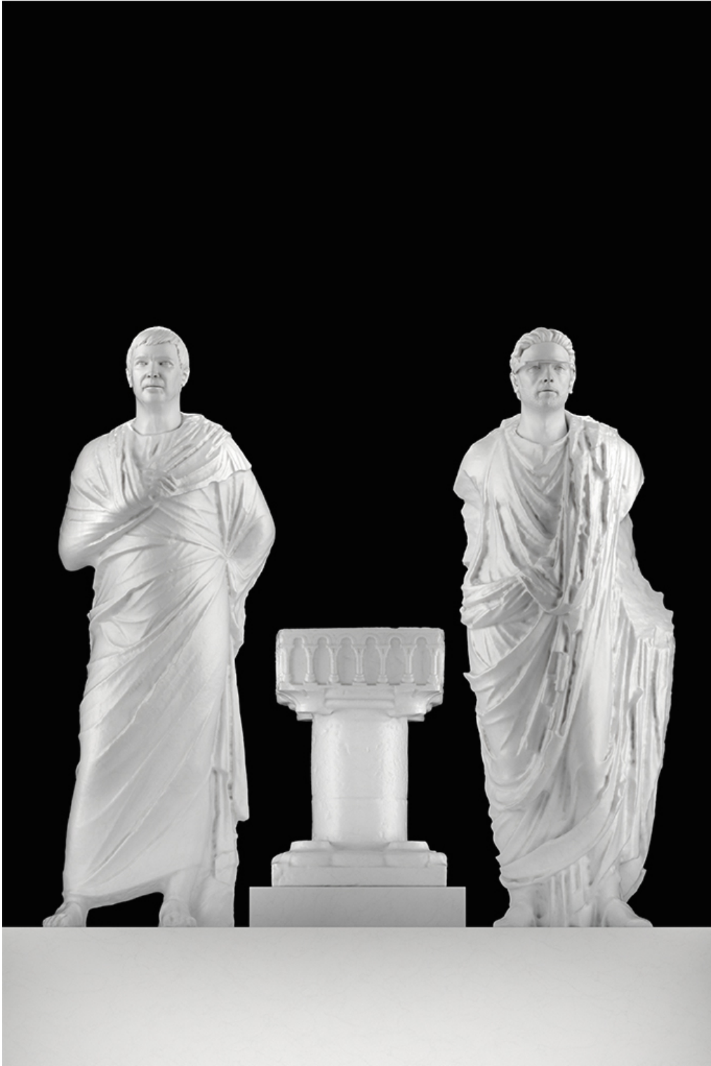
THE GREAT ORACLE