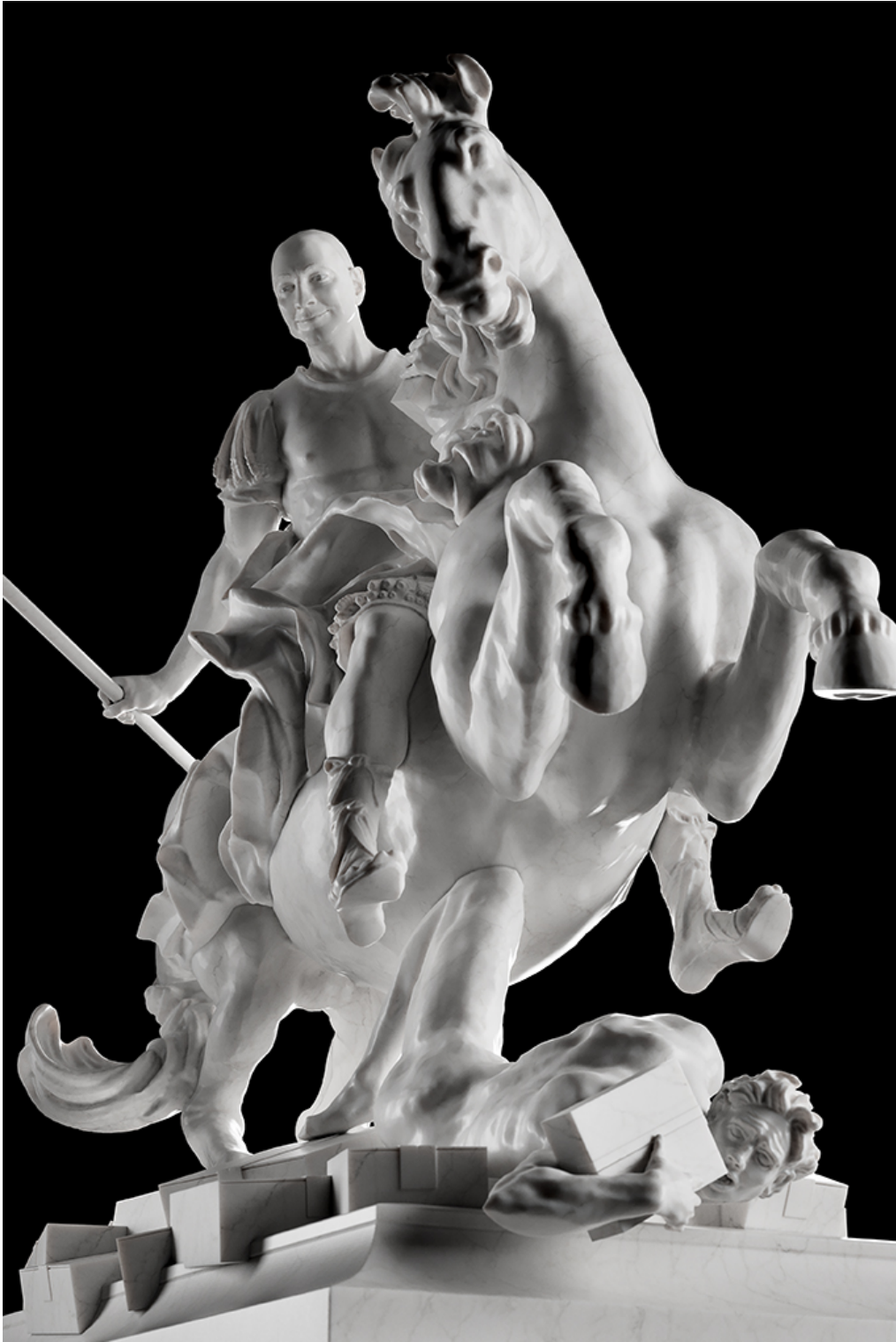
THE CORPORATE NATION